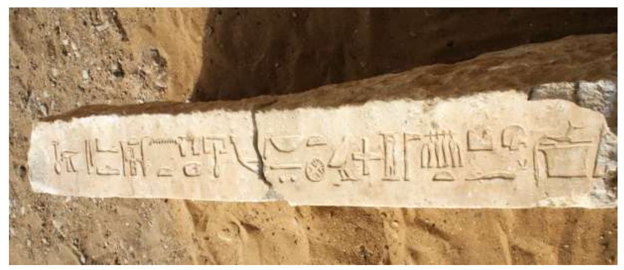
[FIGURE 2]: Inscribed lintel of Seshemnefer in the excavation site