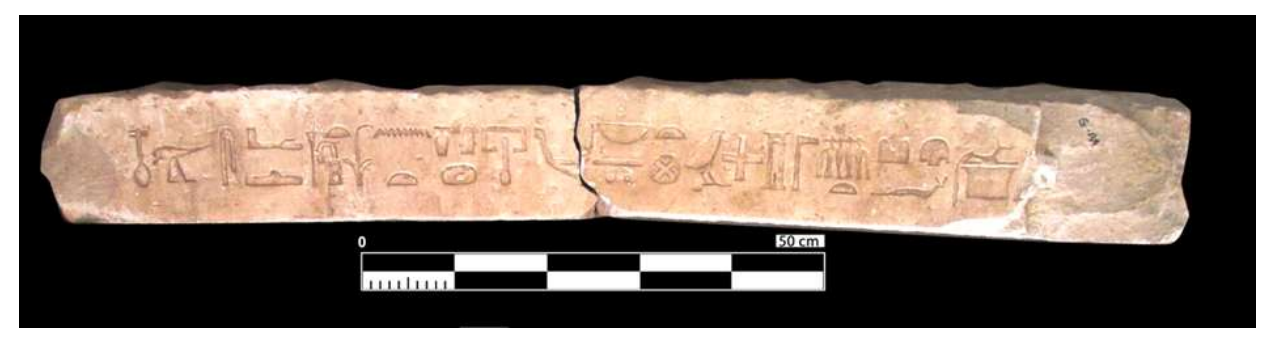
[FIGURE 3]: Inscribed lintel of Seshemnefer in the museum storeroom II at Saqqara

The lintel is adorned with one sunken horizontal line of hieroglyphic inscriptions, starting from the right [FIGURE 4] . The first section of the inscription is lost: