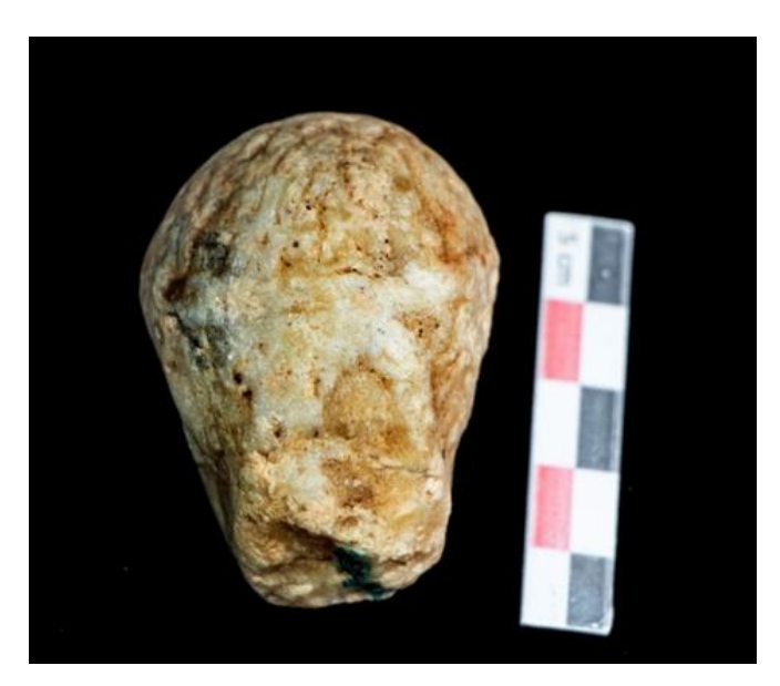
[FIGURE 6]: The knotted diadem at the back of the head