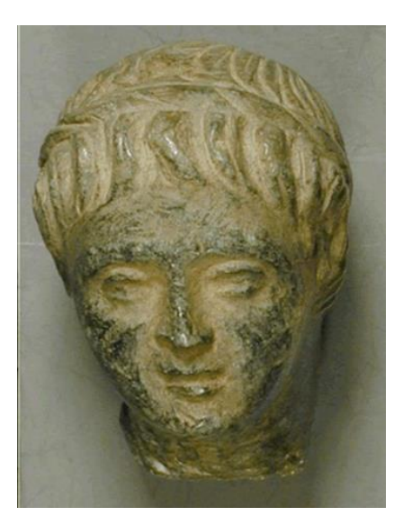
[FIGURE 9]: Greek-style portrait for prince Caesarion made of steatite.

The short hairstyle, as well as the twisted diadem, is also found in a black granite head in Bologna Museum [FIGURE 10]. This piece, dating from the 1st century BC, is also thought to represent Caesarion. Aside from minor damages of the diadem, the features are carefully stylized. He eyes are well carved, and the Egyptian uraeus is visible in front of the diadem. The hairstyle is similar to the head found in Kom el-Louli<sup>23</sup>.