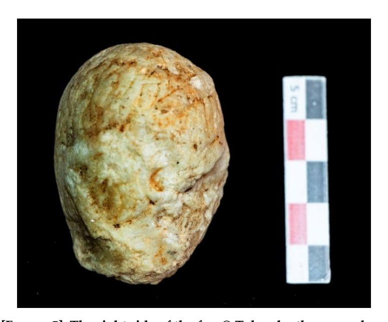
[FIGURE 5]: The right side of the face<sup>®</sup> Taken by the researchers

As for the right side, only the upper part of the right ear and part of the tied diadem are visible [FIGURE 5]. It is worth noticing that the right side of the head is damaged in a way that suggests that this destruction was intentional. In other words, the facial features of the head were destroyed on purpose in order to eliminate the identity of the owner.