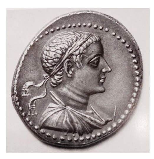
[FIGURE 8]: Portrait of Ptolemy V.

The slicked-forward hairstyle and the twisted diadem are two remarkable features that were strongly attested through other Ptolemaic royal portraits by the mid of 1st century BC. Such examples appeared as small heads, which have been discovered in large numbers in Alexandria and the Nile Delta and appeared to have been part of the cultic worship of the Ptolemaic royal ancestors<sup>17</sup>. It is possible that they were placed in shrines as votive offerings by private individuals or as figures in household altars<sup>18</sup>.