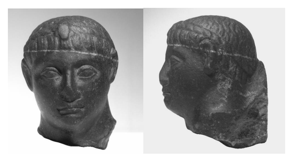
[FIGURE 10]: Portrait of Ptolemy XV Caesarion Greek-Egyptian, Inv.№.KS 1803© Bologna, Museo Civico Archeologico in Italy

The short hairstyle, as well as the twisted diadem, is also found in a black granite head in Bologna Museum [FIGURE 10]. This piece, dating from the 1st century BC, is also thought to represent Caesarion. Aside from minor damages of the diadem, the features are carefully stylized. He eyes are well carved, and the Egyptian uraeus is visible in front of the diadem. The hairstyle is similar to the head found in Kom el-Louli<sup>23</sup>.