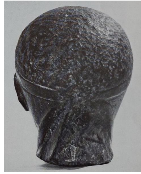
[FIGURE 11]: Portrait of Ptolemy XV Caesarion Greek-Egyptian.