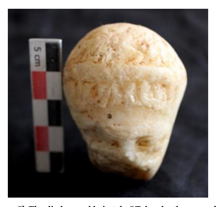
[FIGURE 7]: The diadem and hairstyle

The hair consists of fringes that hang over the forehead, which is also a style that appears in large sculptures<sup>7</sup>. However, the appearance of short fringes of hair under the headdress appeared as early as the second century BC, especially in Egyptianizing portraits. During this era, portraits of Ptolemaic kings such as Ptolemy V and Ptolemy VI bore similar hairstyles accompanied by the Egyptian royal Nemes headdress <sup>8</sup>. In official portraits, the headdress was a significant symbol to convey the idea of supreme power enjoyed by a single individual, as it is a symbol of royal status.