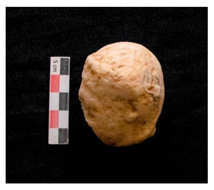
[FIGURE 4]: The left side of the face<sup>®</sup> Taken by the researchers

As for the right side, only the upper part of the right ear and part of the tied diadem are visible [FIGURE 5]. It is worth noticing that the right side of the head is damaged in a way that suggests that this destruction was intentional. In other words, the facial features of the head were destroyed on purpose in order to eliminate the identity of the owner.