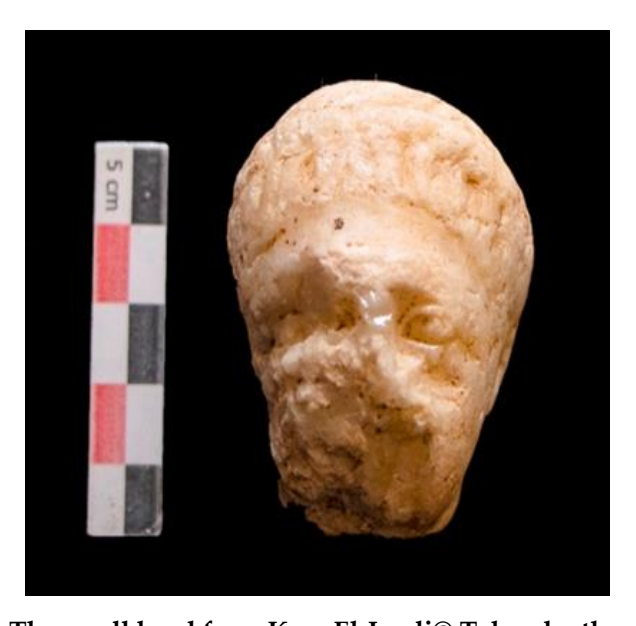
[FIGURE 3]: The small head from Kom El-Louli

The left eye is in good state of preservation, despite the small irregular shaped hole in the eye. The left eyebrow is almost unrecognizable due to the rough surface of the face, apparently caused by a hard object [FIGURE 3].