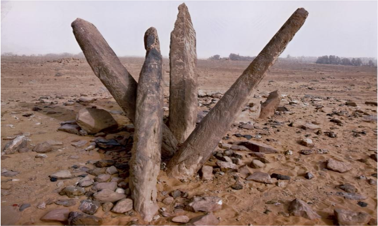
[FIGURE 9]: The stone pillars are standing, sloping or damaged into pieces. https://mautz.net/saudi_2019/saudi.htm , Accessed on October 2/2019.

The fourth point is the existence of some of the so-called Thamudic signs inscribed on some stone pillars of the Rajajil site. These signs are dated between the third century BC and the third century AD (see supra ). The reasons mentioned above have forced people to migrate from the Rajajil site to another area. Thus, the site became abandoned for a long time. Later, some travellers or local Bedouins camped the site and reused some stone pillars as non-solid houses while the other pillars reused them as gravestones. Accordingly, some pillared burial structures in Rajajil's fenced area were reused - if not rebuilt - to serve domestic purposes later, even shortly after they lost their original function as burials. Such pillared structures have the same ground plans as in other parts of Northern Arabia, and here they represent double- or multi-chambered burial structures of various types and times. They left a few signs/graffiti/inscriptions on the pillars' remains. The fifth point is that the absence of organic matter among the cairns could be due to decomposition or a fire disaster.