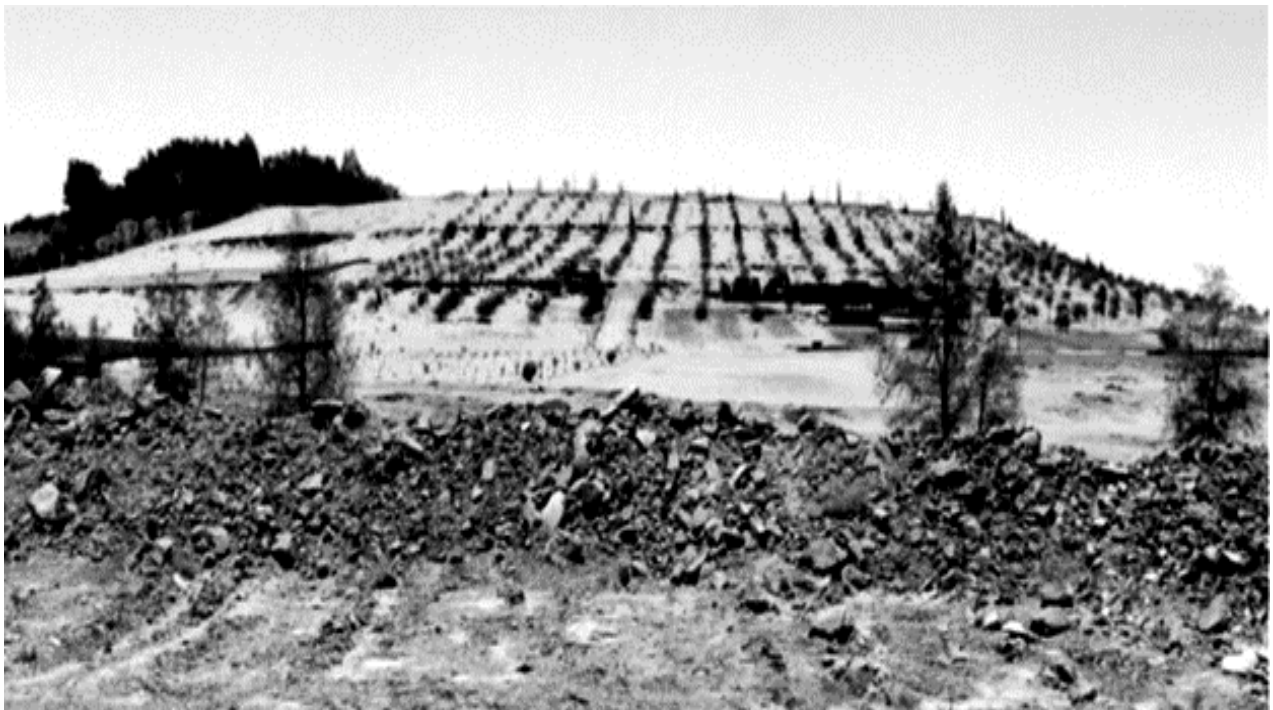
[FIGURE 8]: Bulldozed land surfaces preparing new fields, and an olive yard on the dunes sustained by dripper irrigation with water from deep wells; near Rajajil . GEBEL & WELLBROCK 2019: 253, FIG.12.7.

The first point is to sketch the development of the settlements of the fifth millennium BC. After the climate had become drier and warmer, the pastoral tribes settled in the hydrological favorable areas during the so-called Rapid Climate Change (6000 to 5200/5000 BP) 44 . The Rajajil ground has a rich clay soil suitable for agriculture until now [FIGURE 8], and it looked like an oasis in the middle of the desert. These necessities of life helped people gradually settle down on the site. They fed the flocks at watering locations, built pens and human shelters, practiced their funeral traditions, demonstrated identity by commemorating ancestral bonds, and mediated social and economic relations with their neighbors 45 .