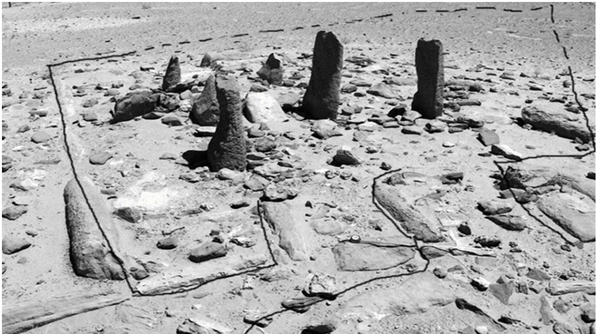
[FIGURE 4]: Remains of pillars and debris on the high hill of Rajajil .

3. In the center of the site, scattered remains of pillars lie on a high hill. The layout of this rectangular structure shows a building divided into courts and side chambers. The standing stone pillars support the roof [FIGURE 4]. This building could represent a temple or a palace for the ruler that was overlooking the site.