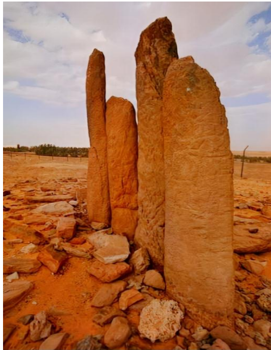
[FIGURE 1]. The standing stone pillars of the Rajajil site.

The current name of this site Rajajil , is derived from the area's local inhabitants. It is an abandoned word that means «standing men» in the local pronunciation. They have chosen this name because the stone pillars appeared to be men standing side-by-side [FIGURE 1] 8 . The Rajajil stone pillars are erroneously often called the «Stonehenge of Arabia» compared to the «Stonehenge of England» in touristic contexts 9 .