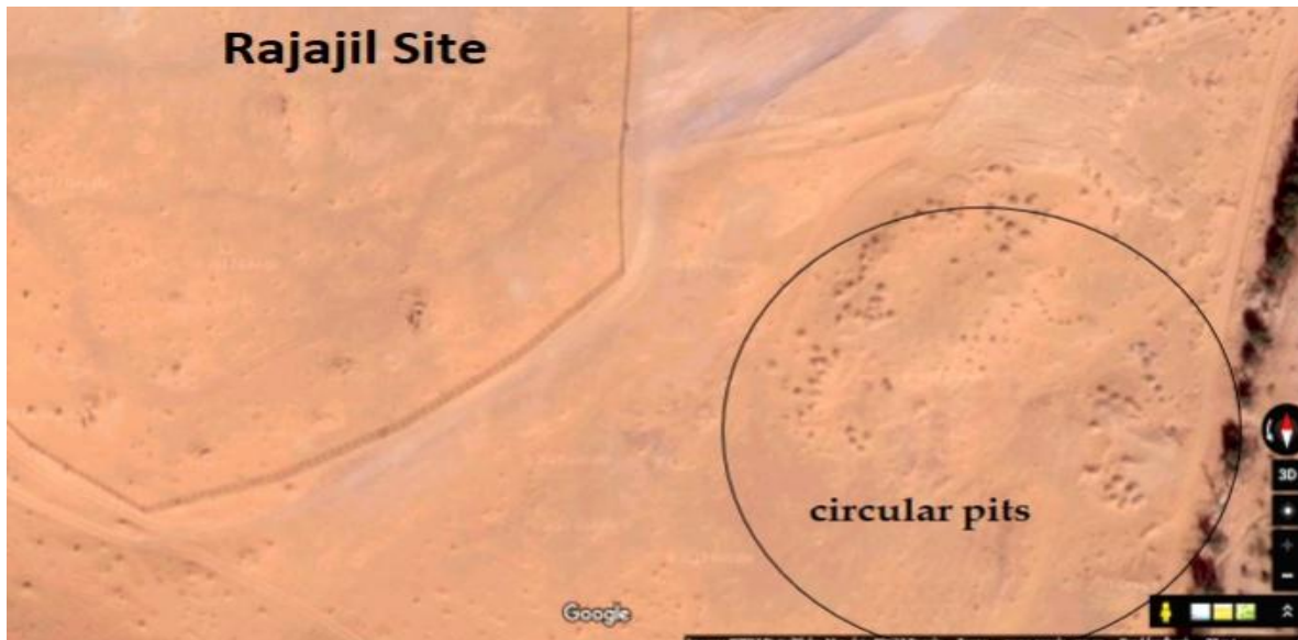
[FIGURE 7]: Some 70 visible pits are on the south slope of the site Rajajil Columns

For all the reasons mentioned above, we can define the stone pillars of the Rajajil site as house columns. All the previous points prove that the site was a settlement for housing. Its inhabitants achieved many agricultural and herding crafts activities, either on the edges of its torrent of freshwater or in wells in the surrounding desert. From this point of view, we can offer more opportunities for observations concerning the landscape of the Rajajil site, which witnessed the growth of oasis life and modest agricultural intensification, setting a course toward complex societies.