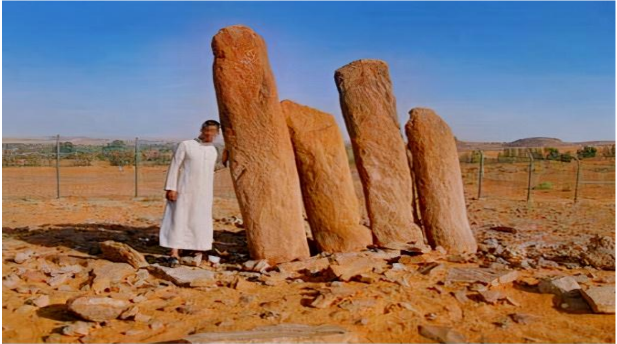
[FIGURE 6]: The height of the Rajajil stone pillars is fit for carrying a roof. Http://www.alrassxp.com/forum/t64779.html , Accessed on June 10/2020.

stacked many pillars to represent the walls of buildings. The cairns of the Rajajil site could also define multi-room structures with enclosed courtyards.