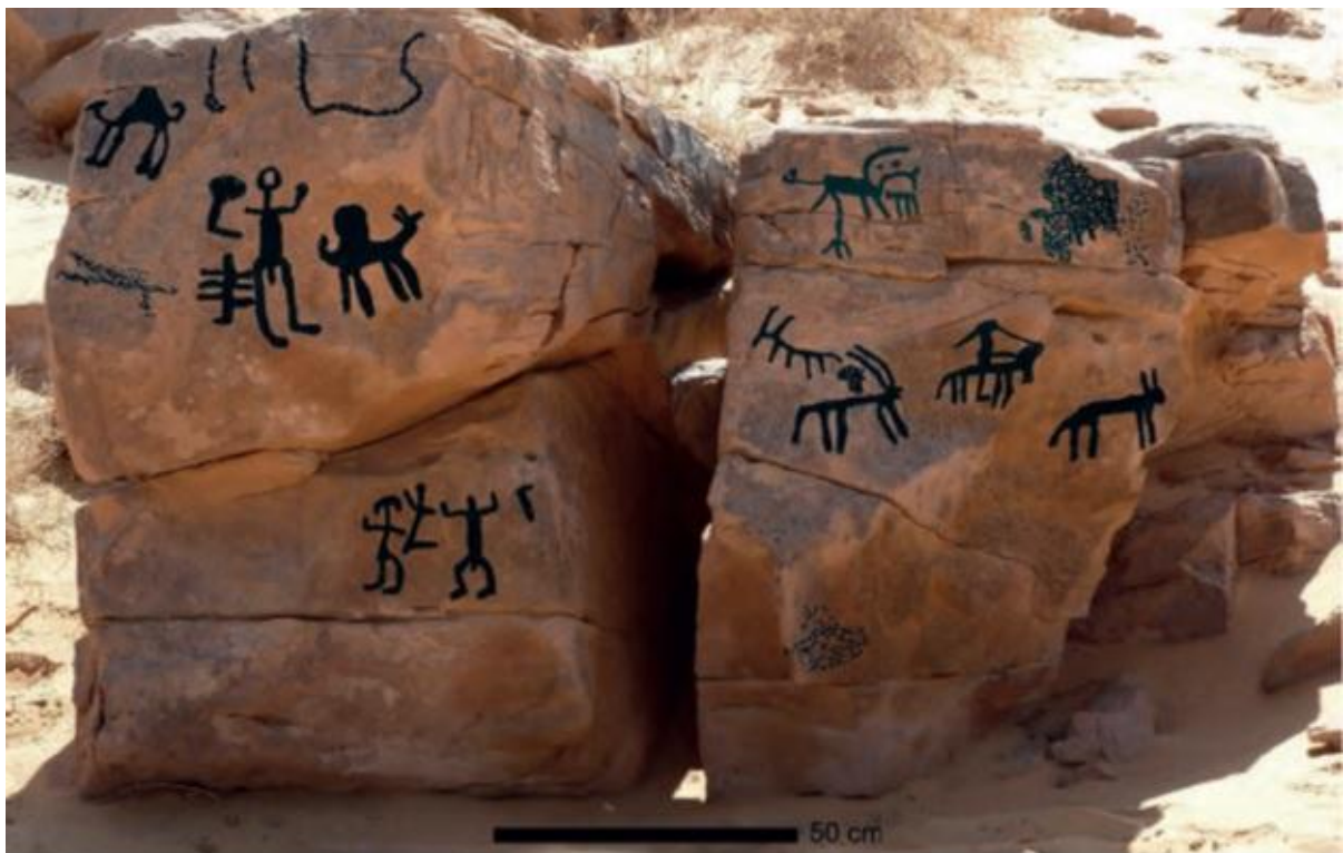
[FIGURE 2]: Thamudic depictions of animals and (socializing) human scenes GEBEL 2016: FIG.19.

1. The Rajajil site has religious significance. Its remains have a circular dimension rounded around an altar or a temple in the middle of the site. Furthermore, there are Thamudic signs of animals (camel? ibex? oryx? cheetah?), riding and (socializing) human scenes (dancing?) on the northern side of the stone pillars [FIGURE 2] 13 . Besides, no other site is close to the Rajajil site's pillared structure in the entire Northern Province. Thus, the site may serve as a communal meeting place for certain diverse social groups to conduct ethno religious roles 14 .