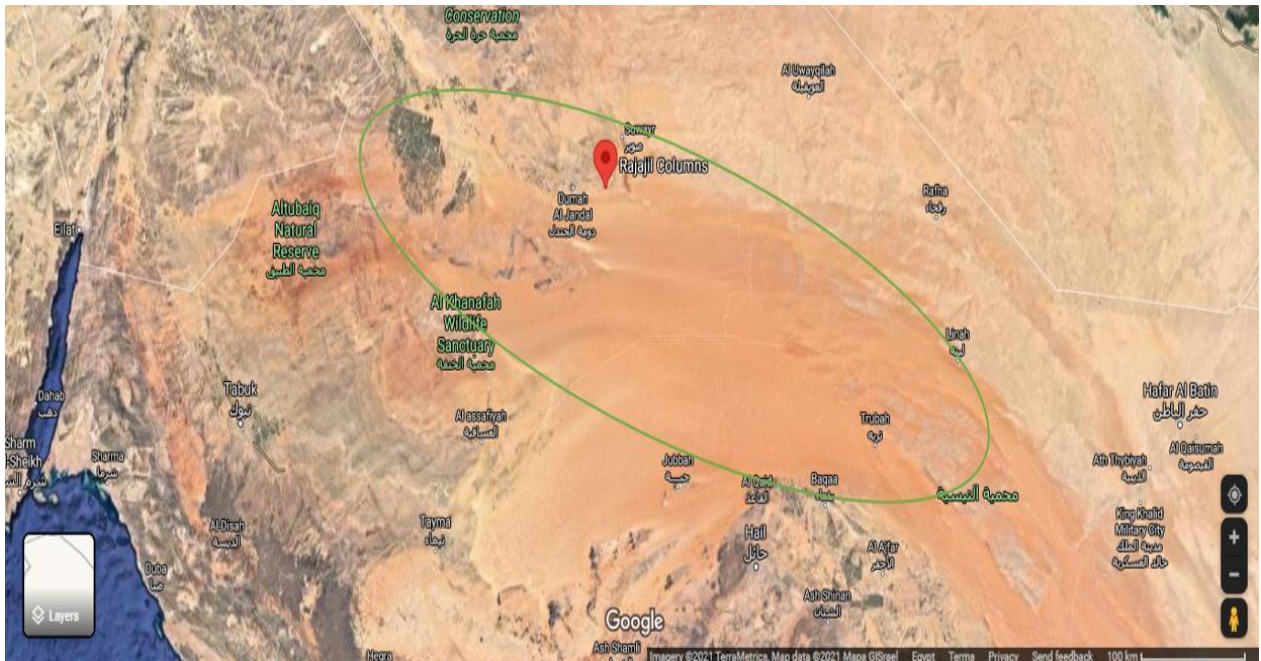
[FIGURE 5]: The Rajajil site locates on the shore of a torrent shore of the freshwater Rajajil Columns - Google Maps

5. According to the photo-analysis of Google Earth, the Rajajil site is located on a torrent shore of freshwater [FIGURE 5]. The inhabitants used this river as a source of freshwater 37 . Additionally, this river deposited sediment along its two edges. Then, these available agricultural requirements made the Rajajil land ideal for stability and residence. Evidently, a cluster of 125 hearths identified the landscape of the Jubbah site that is situated on the coast of an inter-dune lake in the western Nefud desert 38 . We can suggest that this torrent of water gushed into this lake, where the residents settled on the two river edges and its lake.