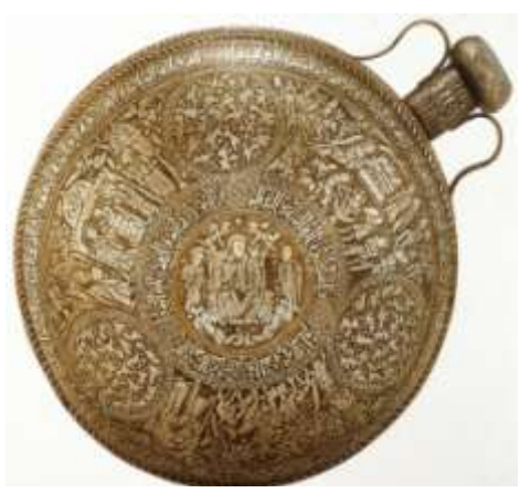
( Pl. 12 )A canteen of brass inlaid in silver no. F1941.10, Freer Gallery of Arts, Washington Syria, mid of the 7<sup>th</sup> century A.H/ 13<sup>th</sup> century A.D. <a href="https://www.si.edu/exhibitions/engaging-the-senses-arts-of-the-islamic-world-6231">https://www.si.edu/exhibitions/engaging-the-senses-arts-of-the-islamic-world-6231</a>