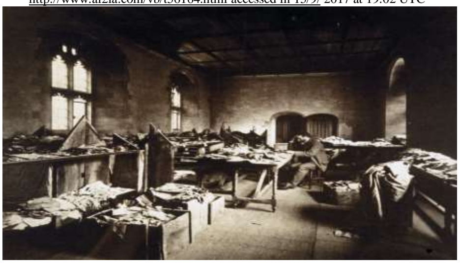
(pl. 2) Cairo Genizah, Tasha Voederstrasse , Tanya Treptow, A cosmopolitan City, Fig. 2.1, p. 27