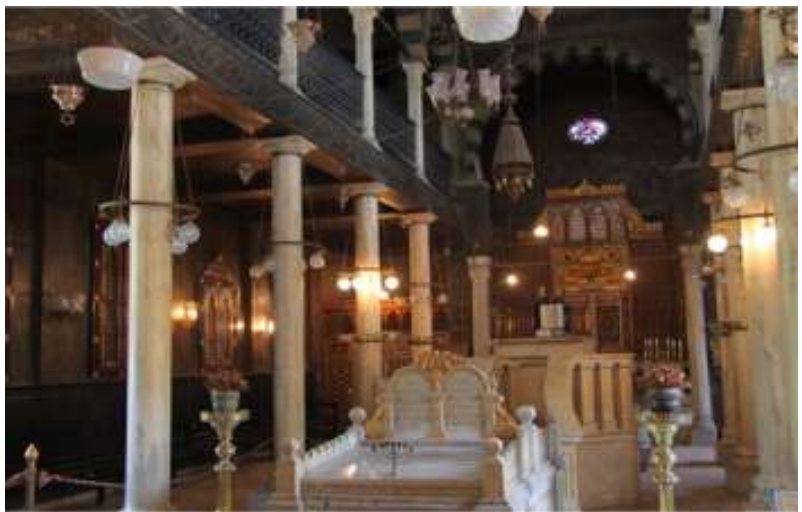
(pl. 7)Ben Ezra Synagogue from interior <a href="https://www.google.com.eg/search">https://www.google.com.eg/search</a>, accessed in 21/8/2017 at 12:54 UTC

(Pl. 8)A copper chandeliers hanged down to the right of the Alter bearing names of the four orthodox Caliphs Ben 'Ezra synagogue, Mugama' al-adian" in Old Cairo captured by the Archaeological Abo El-'Ela Khalil