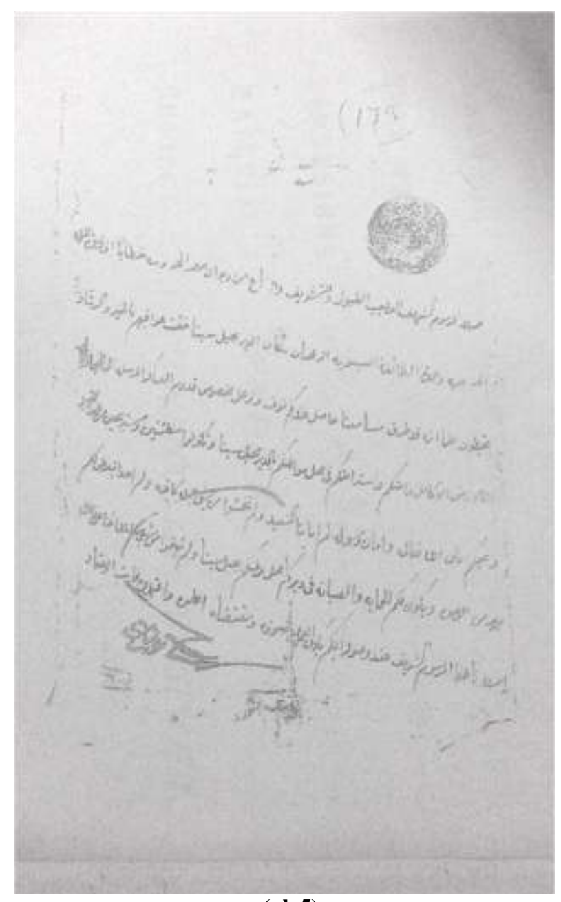
(pl. 5) An arabic firman signatures by Divan Misr al-Mahrusa with Muhammad Ali Pasha seal Library of supreme council of culture, Cairo, Roll no. 175, dimensions 32.5x21 C.M,